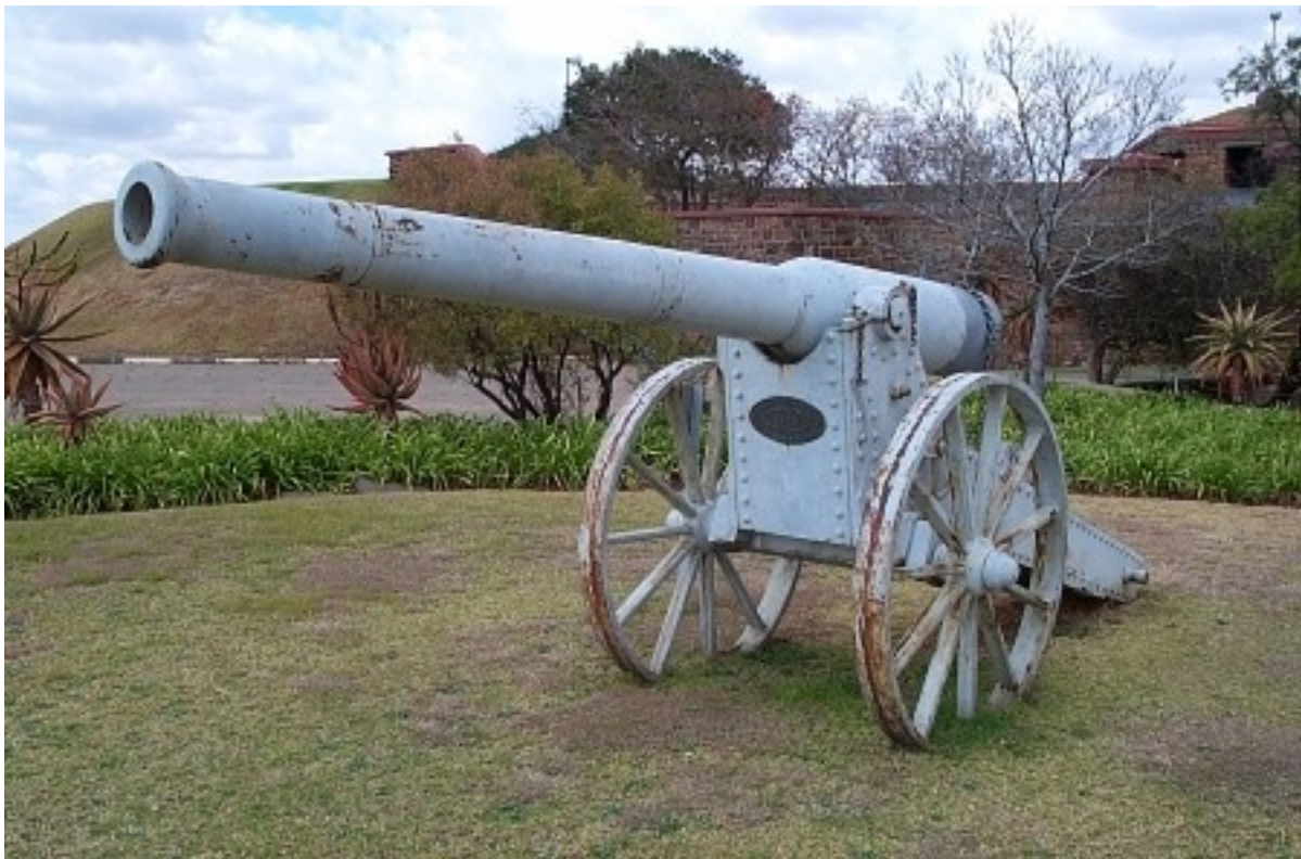
Long Tom (replica) at Fort Klapperkop, Pretoria, SA

All four Long Toms used by the Z.A.R. Artillery were destroyed by the Boer Forces between 22 nd September 1900 and 30 th April 1991 – thus preventing them falling into British hands.